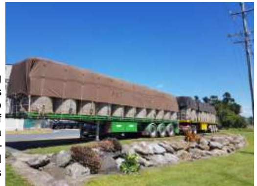
The Reef Gateway's Parma for a Farmer initiative has funded road trains of hay for local farmers.

The crew at Blue Care Mackay ran a charity car wash recently with proceeds going to the Buy a Bale cause for drought-stricken farmers. Well done to all the volunteers who pitched in. The Reef Gateway Hotel in Cannonvale is on board too. Hats off to the hotel and all the diners who supported their farmer support initiative. The Reef Gateway is donating $10 from every parma they sell to the drought relief and Buy a Bale campaigns. They have already raised more than $13,000. They have pre-purchased hay and will donate trucks, fuel and staff to deliver hay to farmers in need as locally as possible. That means four trailers full, or two road trains, or 176 bales in total. Well done to all who contributed for this great cause.