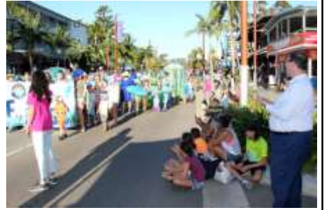
The street parade at the Whitsunday Reef Festival was a riot of colour.

There was no shortage of colour at the recent Whitsunday Reef Festival at Airlie Beach. I had the great pleasure of awarding prizes in the wearable art competition before watching the street parade. Airlie Beach turned on some of its finest weather for our visitors.