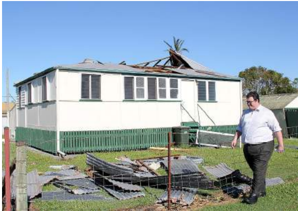
The Whitsundays and Bowen will receive $7 million in funding to help the tourism industry bounce back from the impact of Tropical Cyclone Debbie.

Mackay: 07 4944 0662 Canberra: 02 6277 4539