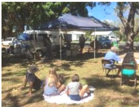
People enjoying the Open Mic entertainers

If anybody has any suggestions of things they would like to see at the markets please let any of the Committee know or make suggestions on the "Hibiscus Coast Progress and Sports Association" Facebook page.