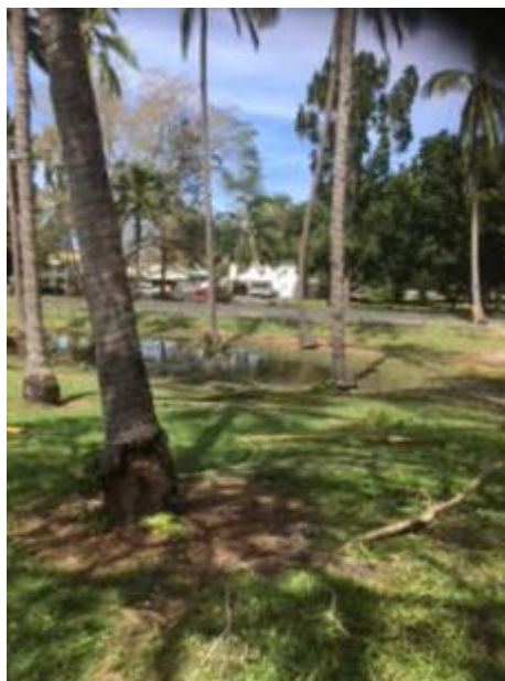
This is where the car show was going to be. Better suited to a boat show on the day!