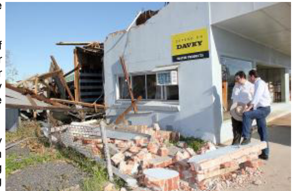
Businesses and shopfronts in Proserpine were significantly damaged during Cyclone Debbie.

Visit www.qraa.qld.gov.au or phone 1800 623 946 with queries. Primary producers can also access freight subsidies of up to $5,000 to assist with the movement of emergency fodder for livestock, building or fencing materials, machinery or equipment, fuel, animals purchased for restocking and transport of produce to market. Visit www.daf.qld.gov.au .