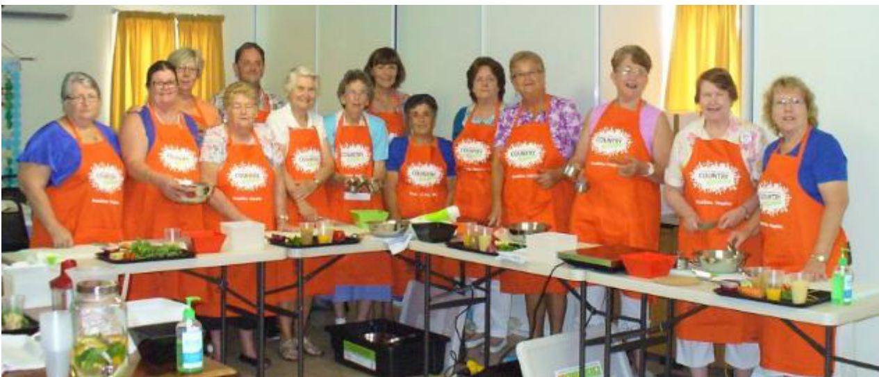
Ladies and gents taking part in the first Country Kitchens workshop held at the Seaforth QCWA Shed on 8th March

Wishing you all a happy day and a very Happy Easter.