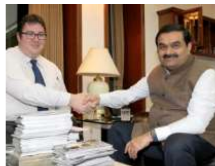
MP George Christensen travelled to India to meet with Carmichael Coal Project developer Gautum Adani.

I have recently travelled to India, at my own expense, to take a clear message to the Carmichael Coal developer Gautum Adani. I wanted Mr Adani to know that this region has the will, the workers and the capabilities to support his project and he was impressed with the level of support demonstrated through the postcard messages I delivered to him. Most people in this region understand the need for this development as businesses need the work, and workers need the jobs, it will generate.